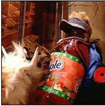
Snapple to Attention: From left, a memorable 2003 Snapple ad featuring guinea pigs.